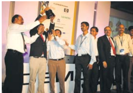
SAP Demo Jam Award 2007