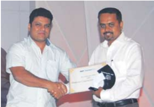
SAP Best Performing Extended Business Member 2009