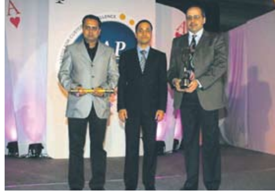
SAP ACE Award 2008