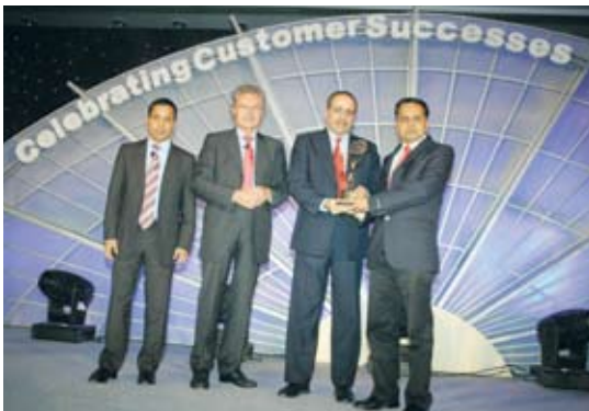
SAP ACE Award 2007